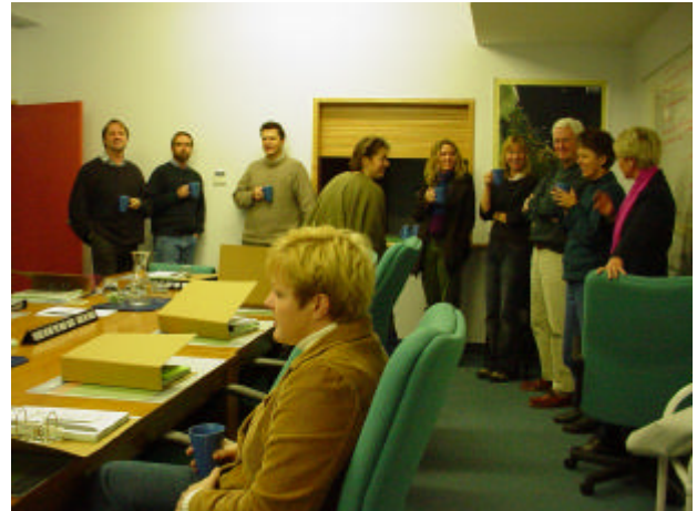
The Bay of Plenty team enjoying a well-earned break